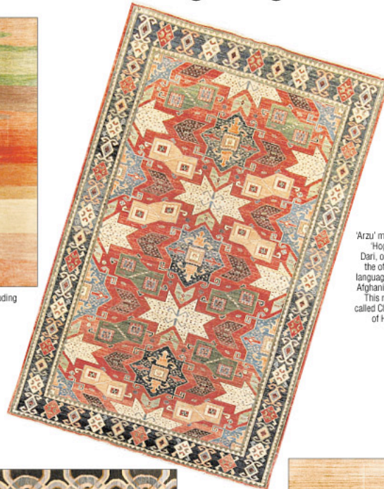
'Arzu' means 'Hope' in Dari, one of the official languages of Afghanistan. This rug is called Chains of Hope.