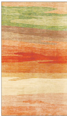
Arzu offers a range of styles, including this more modern Cloud rug.

The opinions expressed in Real Estate Weekend are those of the author and do not necessarily reflect the opinion of The Palm Beach Post .